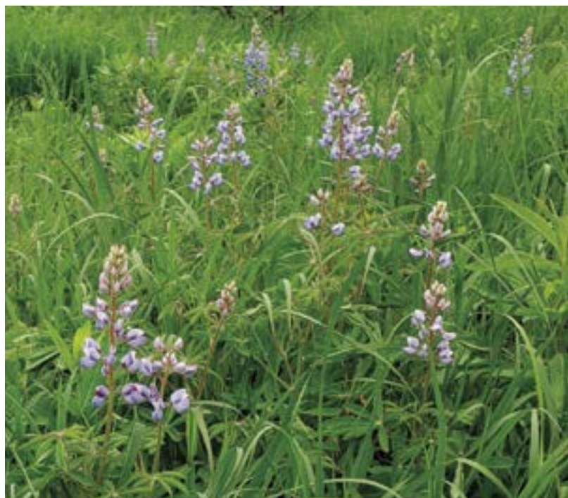
Wild Lupine at Golden Preserve in Springfield Township