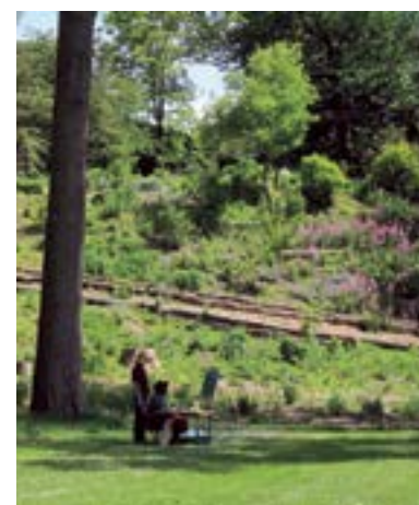
Village of Beverly Hills park