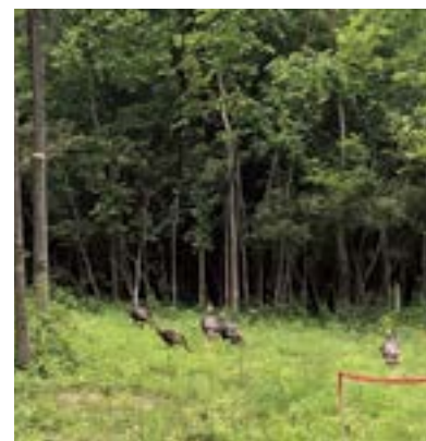
Oakland Township - 23 acres