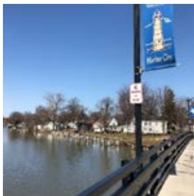
Site of Marine City Marina