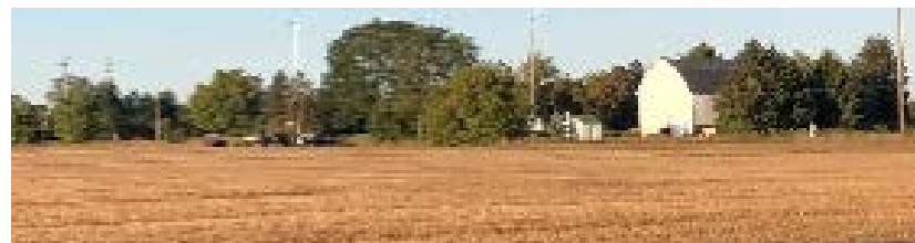
Highland Township 58 acre park site