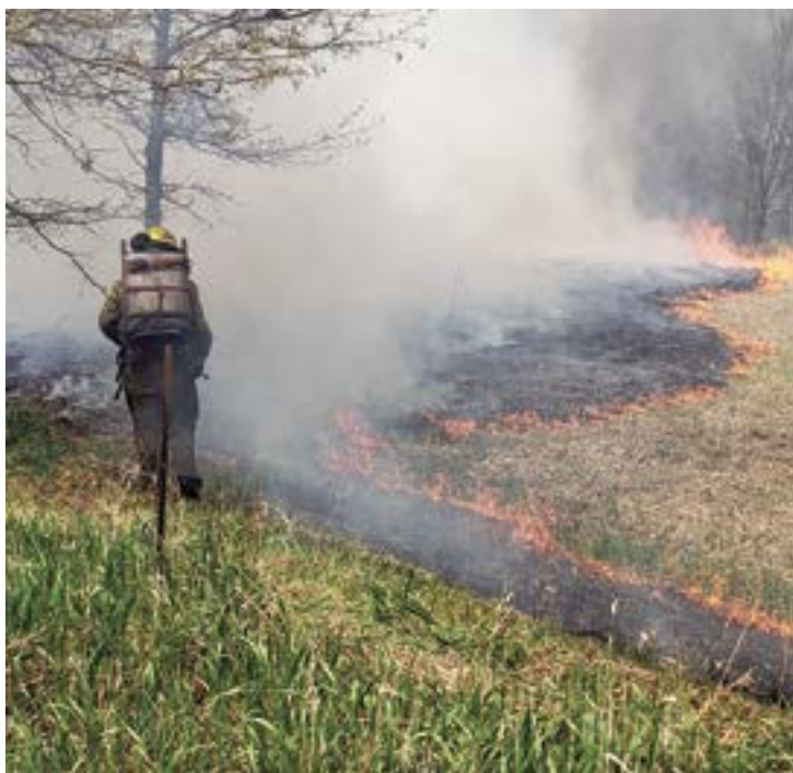
Prescribed burn at the Golden Preserve

SEE PAGE 7 OF THIS NEWSLETTER OR OUR WEBSITE CALENDAR FOR 2023 STEWDAY OPPORTUNITIES!