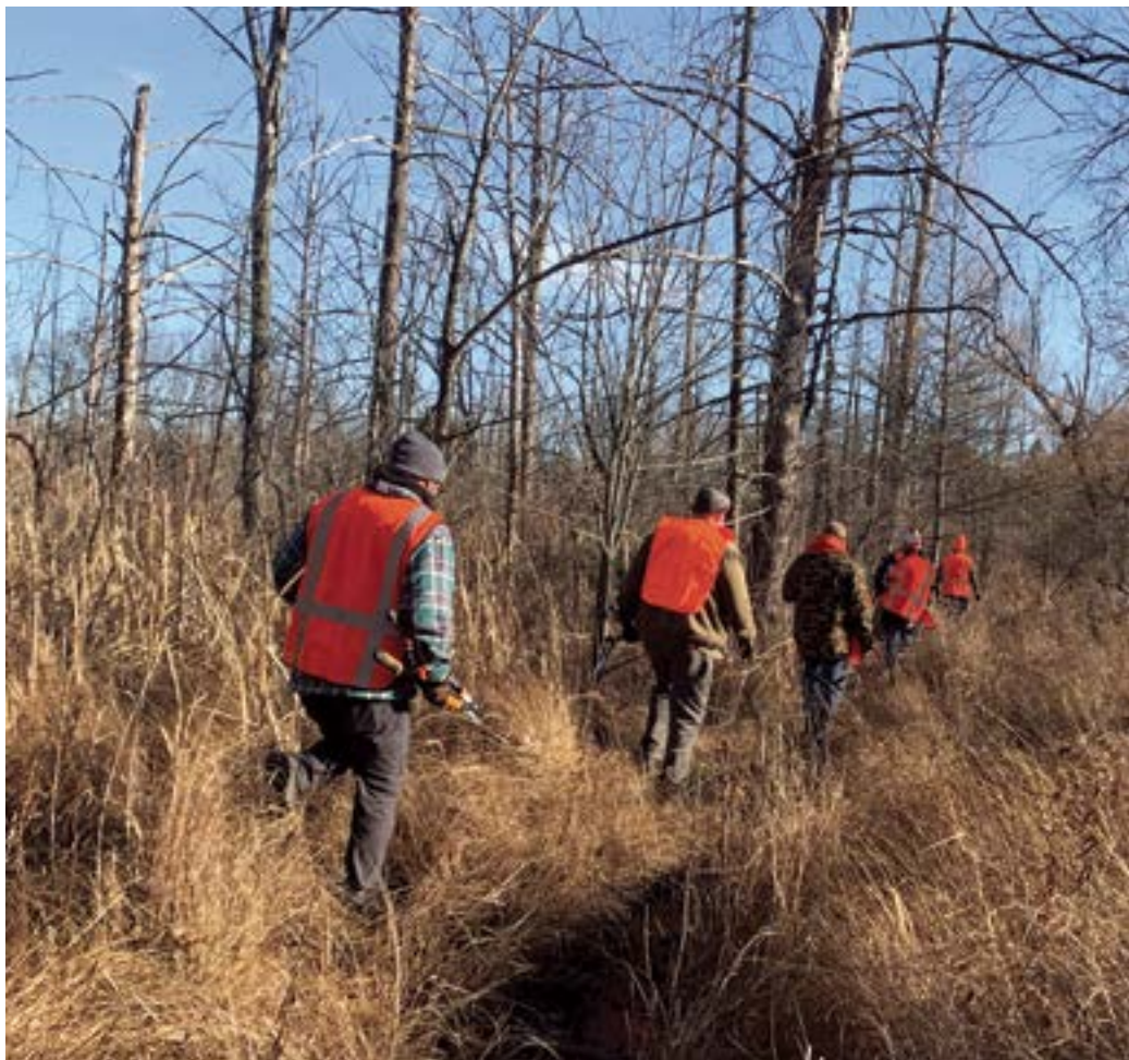
2022 StewDay volunteers at East Pond Creek venture out to tackle woody invasives

Our thanks go out to all of the volunteers who attended our stewardship workday schedule in 2022. Thank you for all that you do!