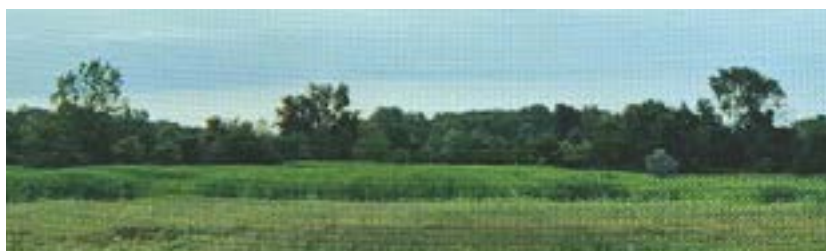
Chesterfield Township 64 acre Monarch meadows site