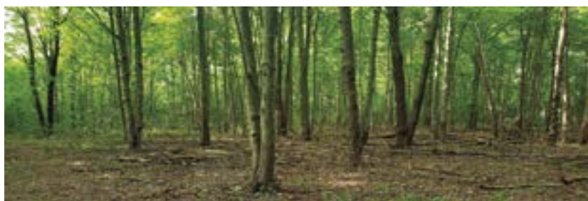
Turtle Woods in Troy